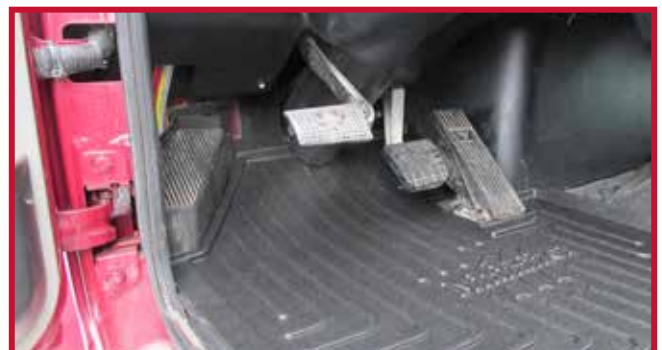
Figure 6 - Driver Side Electrical Enclosure & Floor Mat

• In some cases a steel or plastic electrical enclosure will be mounted on the floor area in the left front corner of the cab as shown in Figure 6. If the electrical enclosure is present, the left front portion of the driver mat will need to be hand trimmed along the raised rib. The area to trim is shaded red in Figure 7.