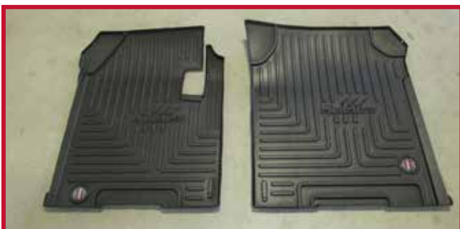
Figure 3 - 10002853 Contents

* 10002853 passenger mat requires hand trimming. Refer to installation step 15 for details.