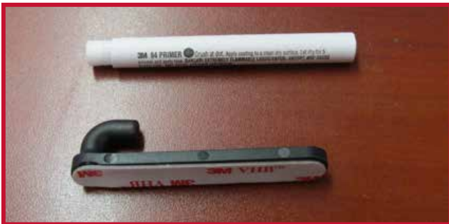
Figure 8 - Hook and Primer 94

7. Insert hook up through the hole in the right rear corner of the driver side floor mat. The hook should fit flush with the underside of the floor mat.