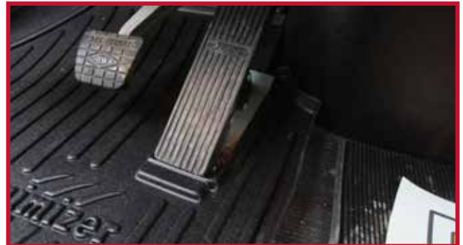
Figure 5 - 10002853 Driver Mat Installation

• In some cases a steel or plastic electrical enclosure will be mounted on the floor area in the left front corner of the cab as shown in Figure 6. If the electrical enclosure is present, the left front portion of the driver mat will need to be hand trimmed along the raised rib. The area to trim is shaded red in Figure 7.