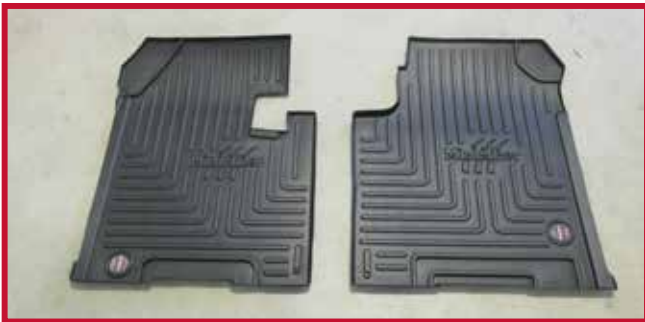
Figure 2 - 10002841 Contents