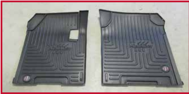
Figure 1 - 10002807 Contents