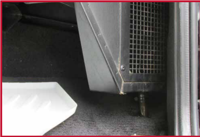
Figure 11 - High Capacity HVAC Unit

Notes: Some trucks may be equipped with a High capacity HVAC unit. This unit is larger than standard and has pipes that go through the floor as shown in Figure 11. In order for the passenger mat to fit around the pipes, the purple shaded area of the passenger mat shown in Figure 12 will need to be trimmed off. Trim along the raised rib with a knife preserving the tall rib for liquid containment purposes.