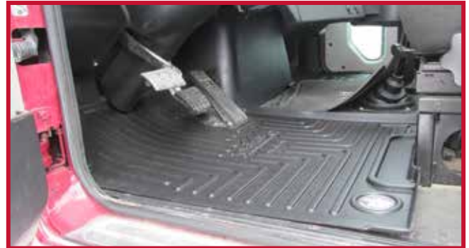
Figure 4 - Driver Mat Position

• The driver mat must be pushed all the way forward so the front lip is making full contact with the doghouse trim panel and fire wall.