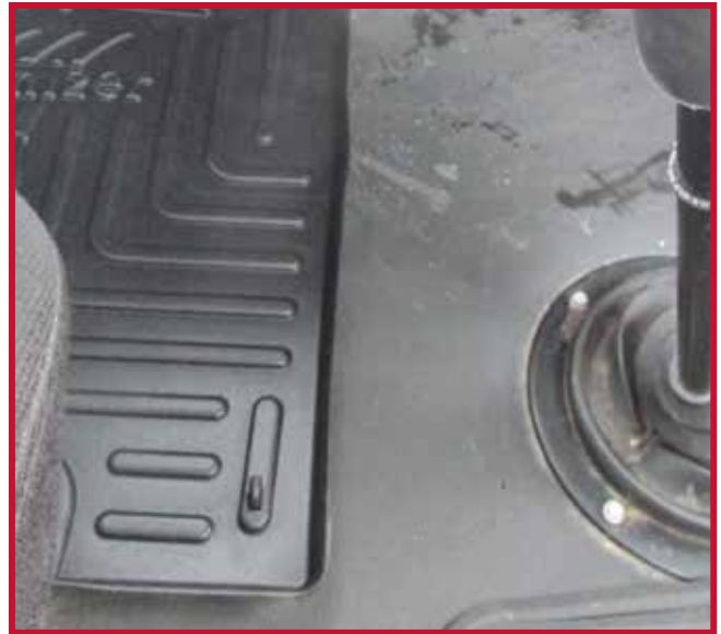
Figure 9 - Driver Mat Hook Installation

9. Unpack the tube of Primer 94 and read the safety precautions printed on the tube.