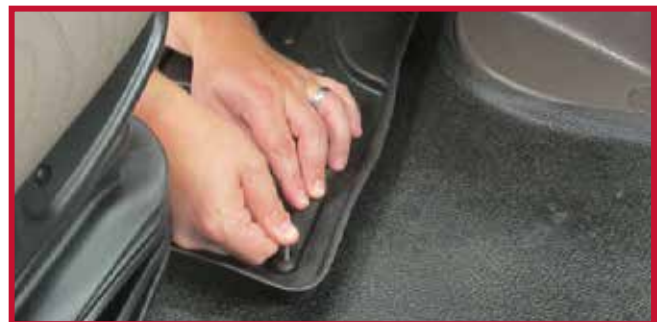
Figure 10 - Apply Pressure to Hook

15. Position the passenger mat in the truck. Make sure the passenger mat is pushed all the way forward so the outside lip makes full contact with the doghouse trim panel and fire wall.