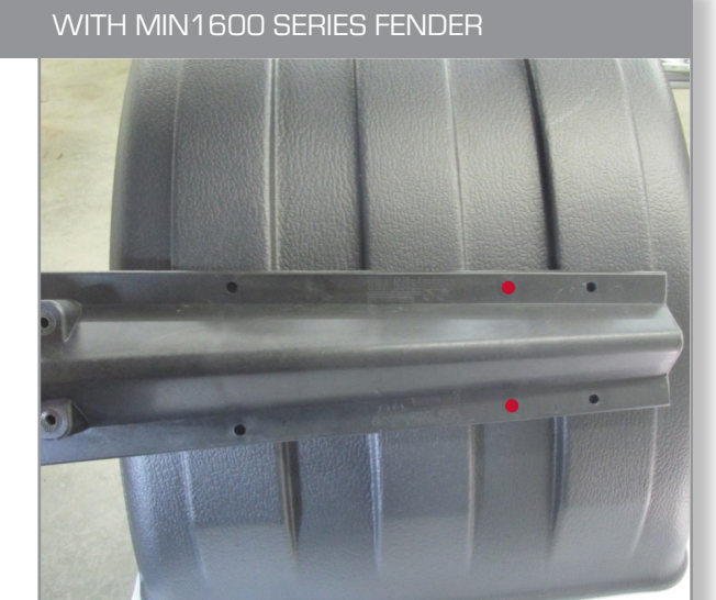
FIGURE 5 - TRIMMED BRACKET ALIGNED

Poly Bracket Arm Trimmed & Drilled To Suit MIN1600 & MIN1900